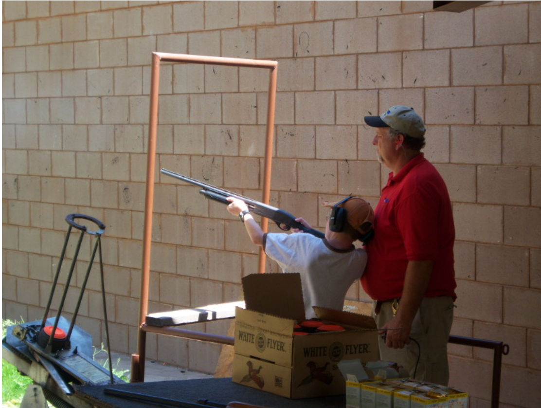
We capped off the 100 degree afternoon with a little cold watermelon that made everyone happy.