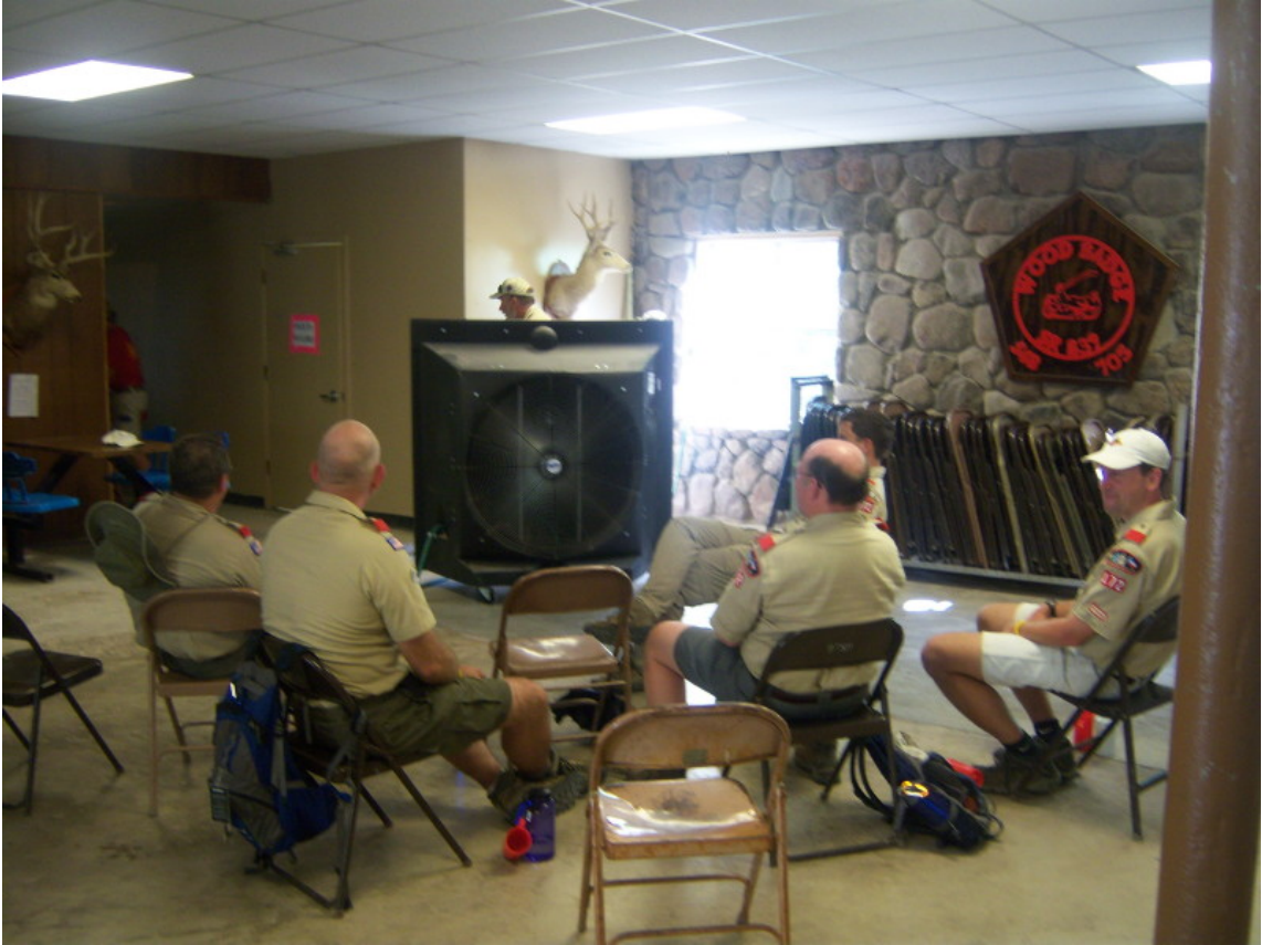
The boys worked on crafts,