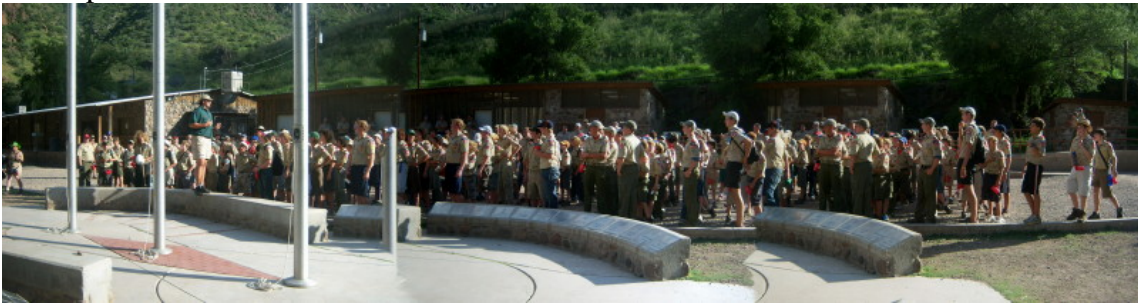
It was another beautiful day at B TSR.