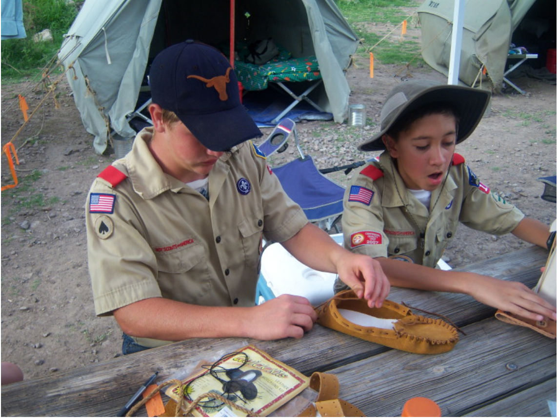
and Scout skills (tying a monkey fist knot),