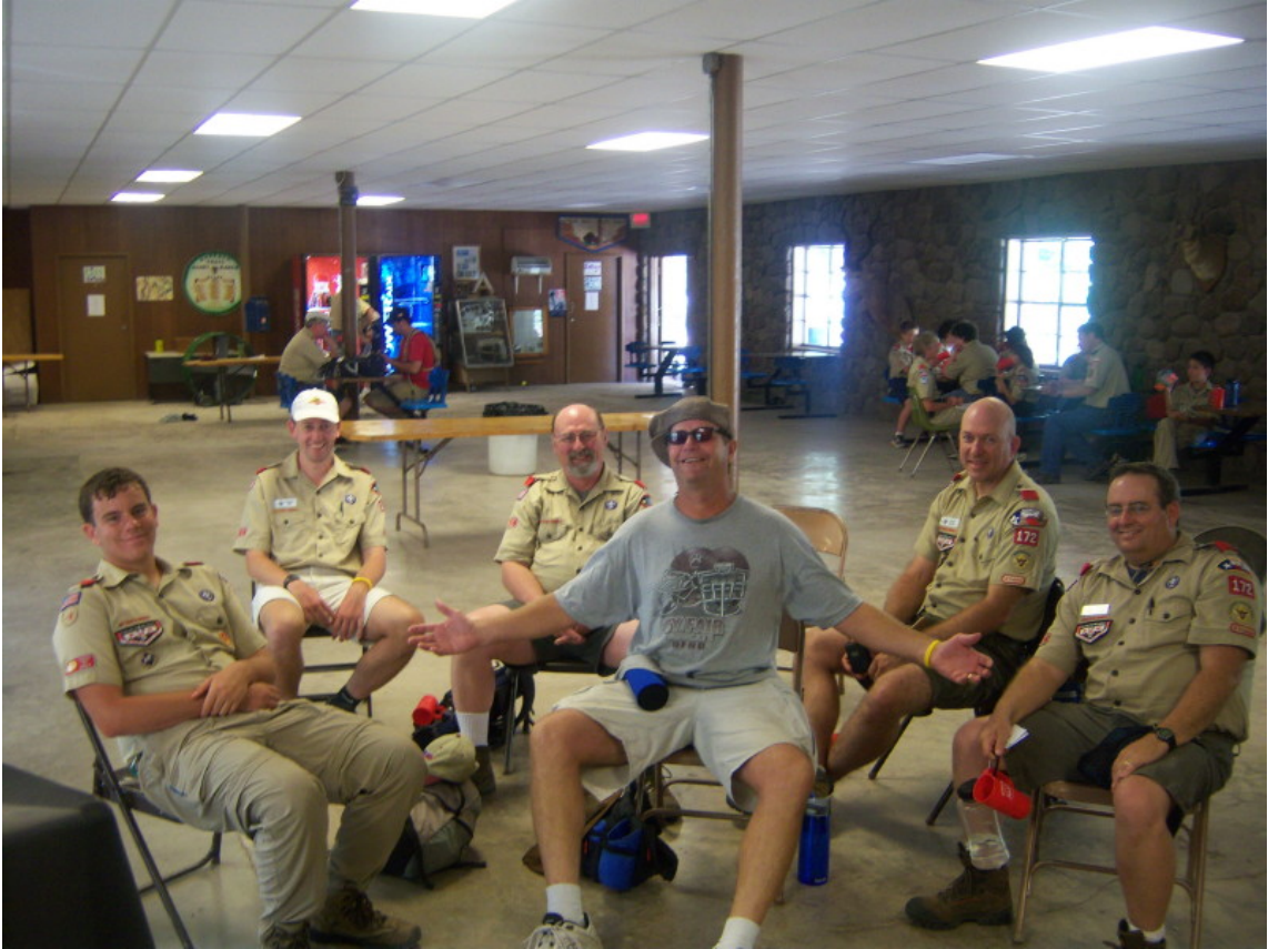
in front of the fan, as it was 100 degrees today.